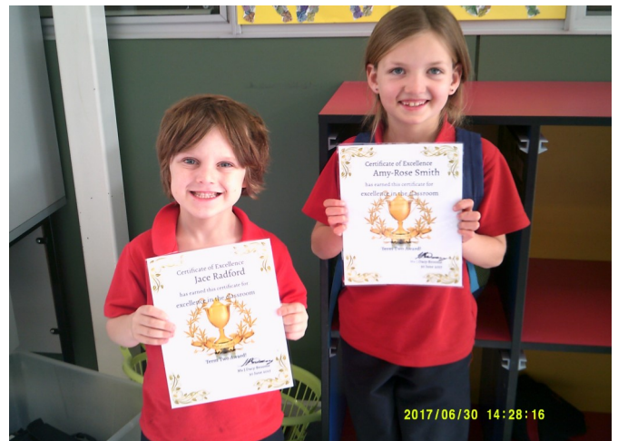
Last term our Book Awards for consistent hard

We also discussed the consequences for disrespecting our values, as School Council suggested a note will go home for parents to sign and return, describing the student's behaviour.